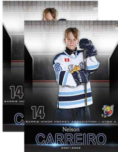
2 - 5x7 PORTRAIT PRINTS