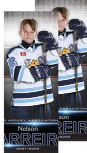
2 - BOOKMARKS