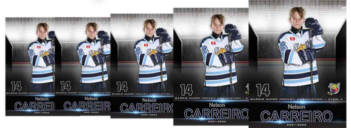
5 TRADING HOCKEY CARDS